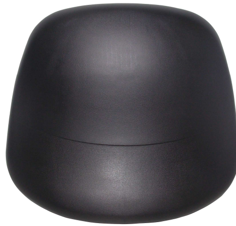
Lucido Low Outer: 692.41201.622