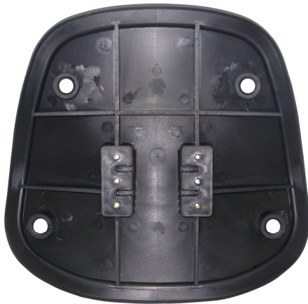
Lucido Low inner: 692.41161.622

Introducing the newest addition to the Artia Chair Back range, the Lucido Low Back Set . Slightly smaller than our traditional Lucido medium back, the Lucido Low back is ideally suited to budget and Student task chairs.