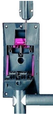
tilt mechanism for large table