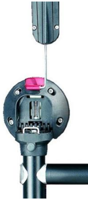
tilt mechanism for small table