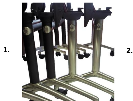
1. Black frame w/ Brushed Nickel legs 2. Brushed Nickel frame and legs