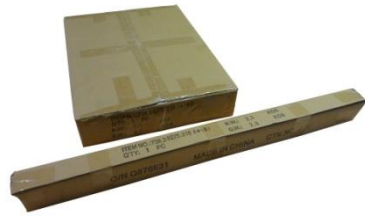
2 cartons = 1 table base

One complete item comprises of two cartons which come flat packed for safe transport and is ready to assemble. Included in the packaging are the components and fixing fasteners along with assembly instructions.