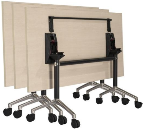
Quick and easy solution for stacking and storing