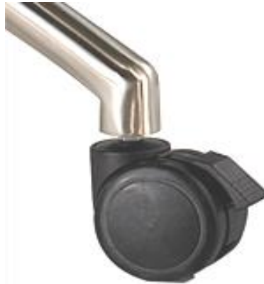
Locking castors for moving and stability