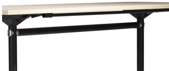
Low profile lever