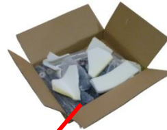
(A) + B = legs + components

For further information please contact one of our customer service teams on 1800 008 591 in Australia, or in New Zealand on 0800 267 265. Alternatively, speak to your local sales representative.